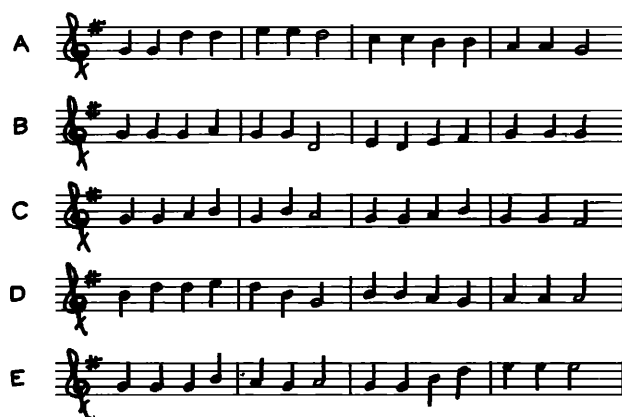
FIG. 3. The first two phrases of each of the undistorted versions of melodies used in Expt. 2: (a) "Twinkle, Twinkle, Little Star"; (b) "Good King Wenceslaus"; (c) "Yankee Doodle"; (d) "Oh Susanna"; and (e) "Auld Lang Syne."

and ascending two octaves (to 2093 Hz). Every effort was made to maintain the same tempo in all stimuli. Stimuli were tape recorded and played to the subjects over loudspeakers as in Expt. 1.